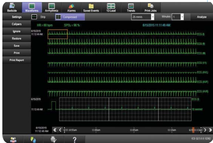
ICS shows 7-leads ECG from AriaTele