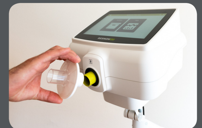
Resmon Pro Full V3 is a product from Restech srl

Complete the diagnostic picture with the Resmon Pro Full V3 for accurate pulmonary resistance measurements. The Resmon Pro Full V3 is a revolutionary and validated Forced Oscillation Technique (Oscillometry) stand-alone device. Get the full picture of asthma, COPD and Post-Covid patients. Testing includes fast (10 breath tidal breathing) assessment of sensitive small airways and lung recruitment.